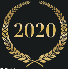
1034 - 2020 Year