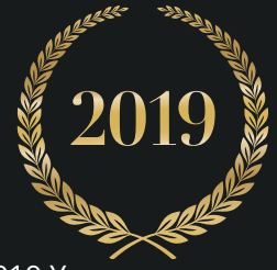
1033 - 2019 Year